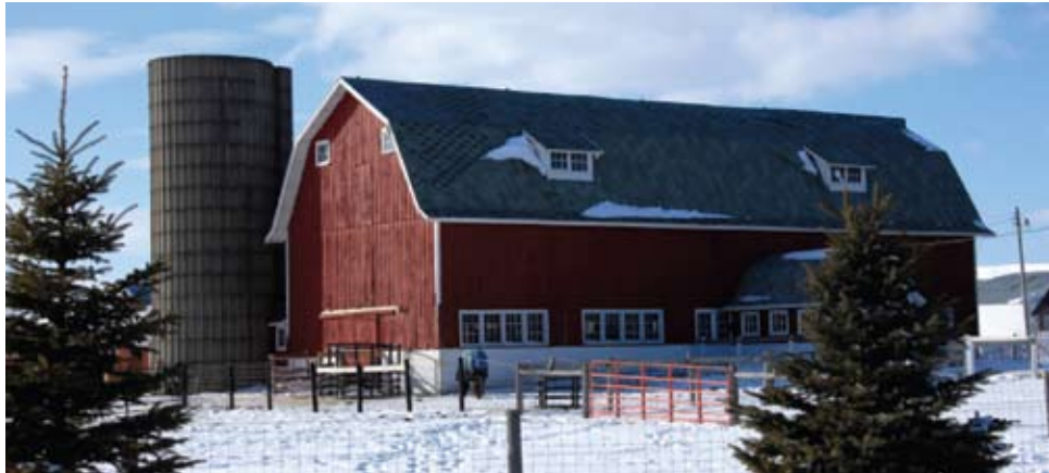
Cellular backhaul in rural Wisconsin