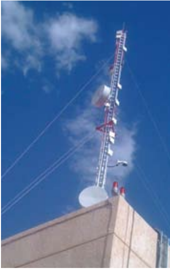
RADWIN's links collocated on rooftop

Project Requirements: TADSEC deployed 300 cameras in a Latin American city. The underlying goal of the 'Safe City' project is to increase public safety and prevent potential crimes and violations.