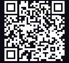
TSW212 360° VIEW